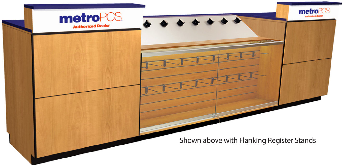
Shown above with Flanking Register Stands

Interactive Illuminated Display Case with attractive brushed metal handset display surface. Cabinet is finished in Fonthill Pear with black and smudge proof Tutti Frutti surface accents. Internally illuminated slatwall merchandising area has lockable sliding front doors. Ample storage space is provided on the service side with locking doors. Can be joined to existing transaction stations. Pre-drilled wiring holes and mounted floor levelers makes this cabinet complete. Ship fully assembled within it's own carton.